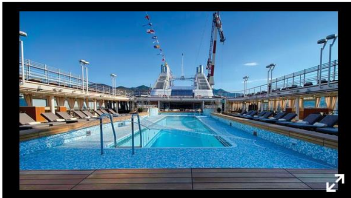
The Silver Muse is the line's newest ship. It launched in April.

The cruise line gave few details about the partnership except to say that McCurry would "chronicle Silversea's extensive fleet and portfolio expansion designed to take guests to some of the world's most intriguing and remote destinations."