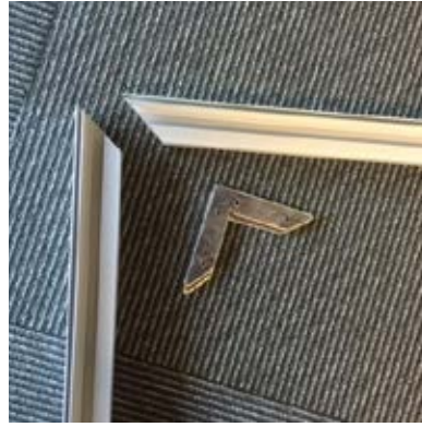
Insert the corner brackets into the tracks of the top and bottom profile of the frame. Screws may need to be loosened to allow brackets to slide into position