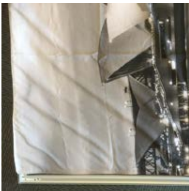
Lay out the fabric skin and start inserting it with its silicone keddar into the rail at the corners of one side. and then at the other corners.