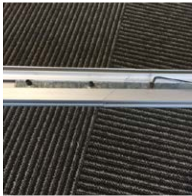
Starting at the top left corner, attach the top and the side profile. Do not tighten the screws until all sides are attached. Ensure all corners are aligned, then tighten all screws using the allen key.