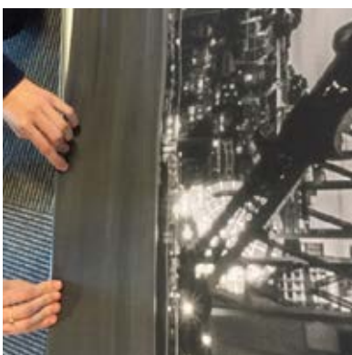
Continue to slide the fabric skin into the profile and on the bottom corner on the other side.