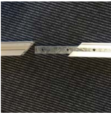
Insert the extension brackets into the tracks of the top and bottom profile of the frame.