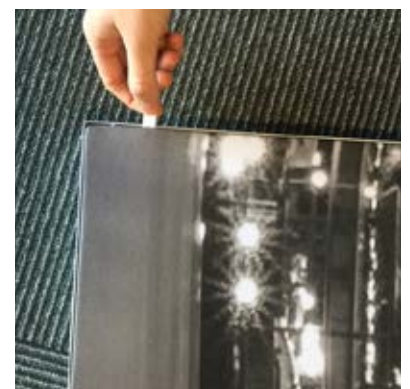
To remove skin from the frame, pull the white cloth.