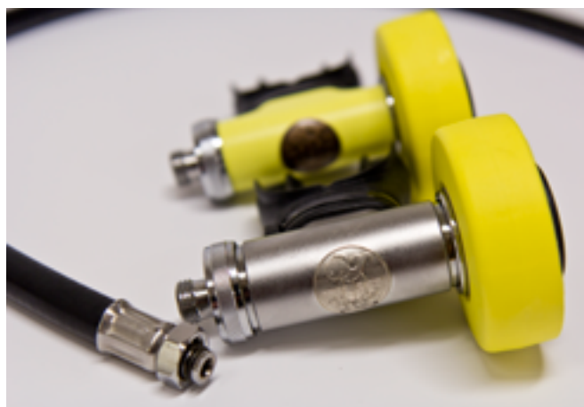
Cyklon Metal Octopus (art. nr 2981 M)