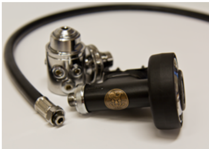
Cyklon 5000 (art. nr 3950)