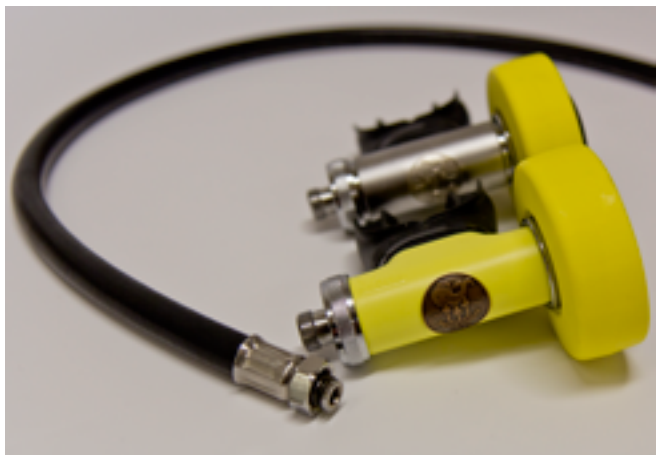
Cyklon Octopus (art. nr 2981)