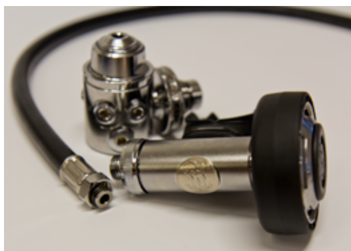
Cyklon Metal (art. nr 3950 M)