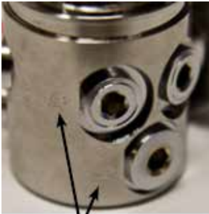
Low- and high pressure ports

Before you assemble your Cyklon regulator, please pay attention to the following: