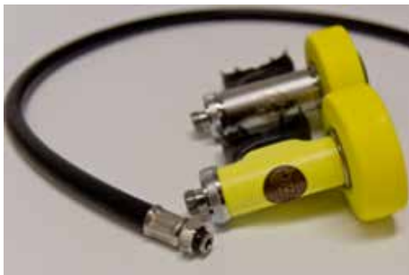
Cyklon Octopus (art. nr 2981)