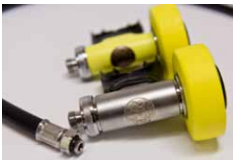
Cyklon Metal Octopus (art. nr 2981 M)