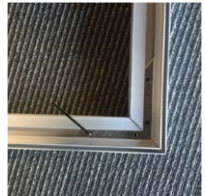
Starting at the top left corner, attach the top and the side profile. Do not tighten the screws until all sides are attached. Ensure all corners are aligned, then tighten all screws using the allen key.