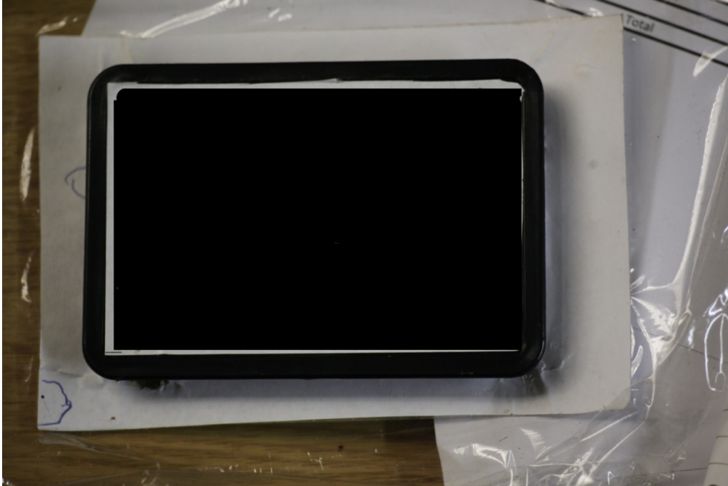
Monitor showing activity from 2 bed bugs in the environment for 1 week.