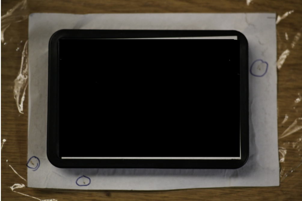
Monitor showing a light infestation detected within 2 weeks of installation in a high turnover location.