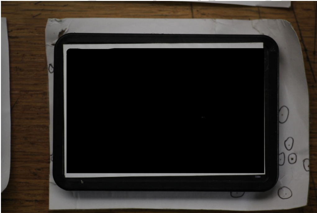
Monitoring where checking was not weekly and thus infestation was allowed to develop to a greater extent producing more faecal traces