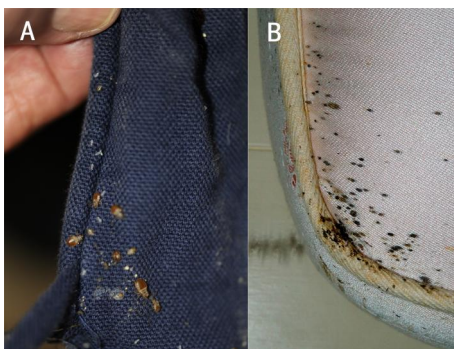
Fig 4 To educate patients to the “search and destroy” strategy, GPs should show them pictures of (A) bed bugs and their typical hideouts and (B) bed bug faecal traces on the mattress