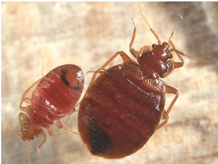
Fig 2 Bed bug nymph (1-4 mm) and adult (5-7 mm): Cimex lectularius