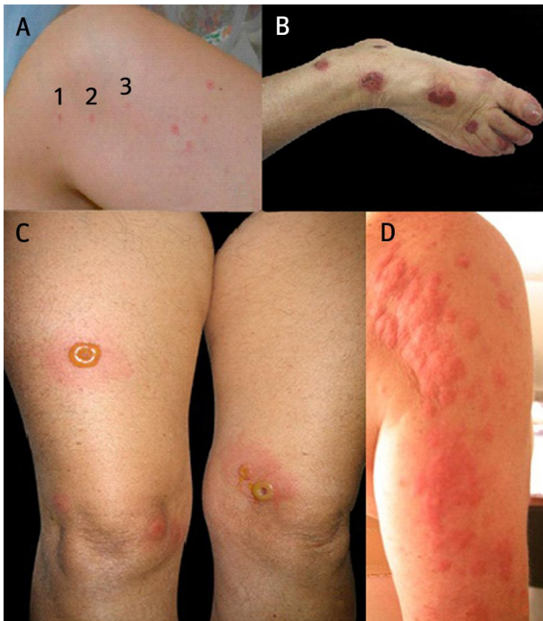
Fig 3 Clinical manifestations of bed bug bites: three or four skin lesions are often seen in a “breakfast (1), lunch (2), dinner (3)” distribution (A) or “wheel” distribution (B). Atypical bullous lesions (C) and urticaria (D)